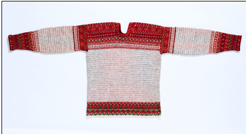
A Korsnäs sweater at the National Museum of Finland