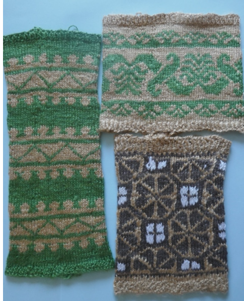
Recreations of knitted-in cuff patterns of three knitted liturgical gloves, showing the variety of such patterns