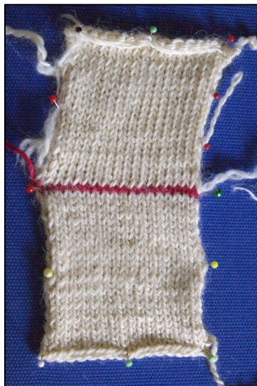
The difference between knitting with plied and non-plied yarns shows clearly after wetting the piece. Knitted with plied yarns, the fabric stays straight (bottom). It 'leans' when knitted with two unplied yarns held together (top)

Dr Katrin Kania, freelance textile archaeologist and reconstruction practitioner, Germany